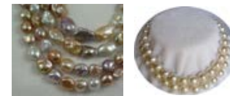
LEFT: SOUFFLE FRESHWATER PEARLS CHINA, RIGHT: PERFECT SPHERICAL SOUTH SEA PEARLS