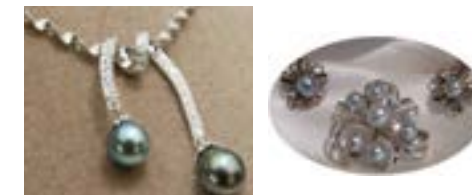
LEFT: MICRONESIA BLUE PEARLS-LE COLLIER, RIGHT: NATURAL BLUE BAROQUE PEARLS