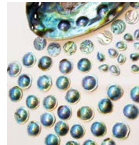
EYRIS BLUE PEARL ON ABALONE AND CUT OFF READY TO MAKE JEWELRY