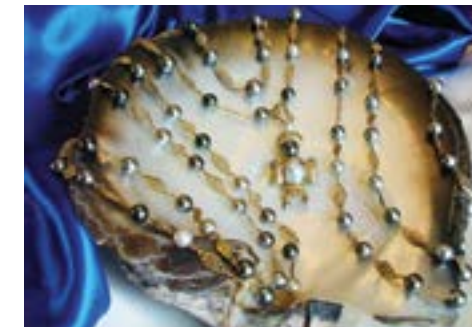
BLACK TAHITIAN PEARL NECKLACES ON OYSTER SHELL

Please visit my website: www.pearlscreation.com www.Pinterest.com/1000pearls/